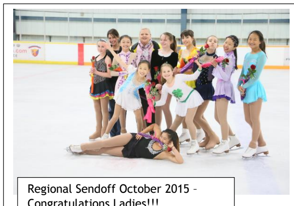
Regional Sendoff October 2015 - Congratulations Ladies!!!